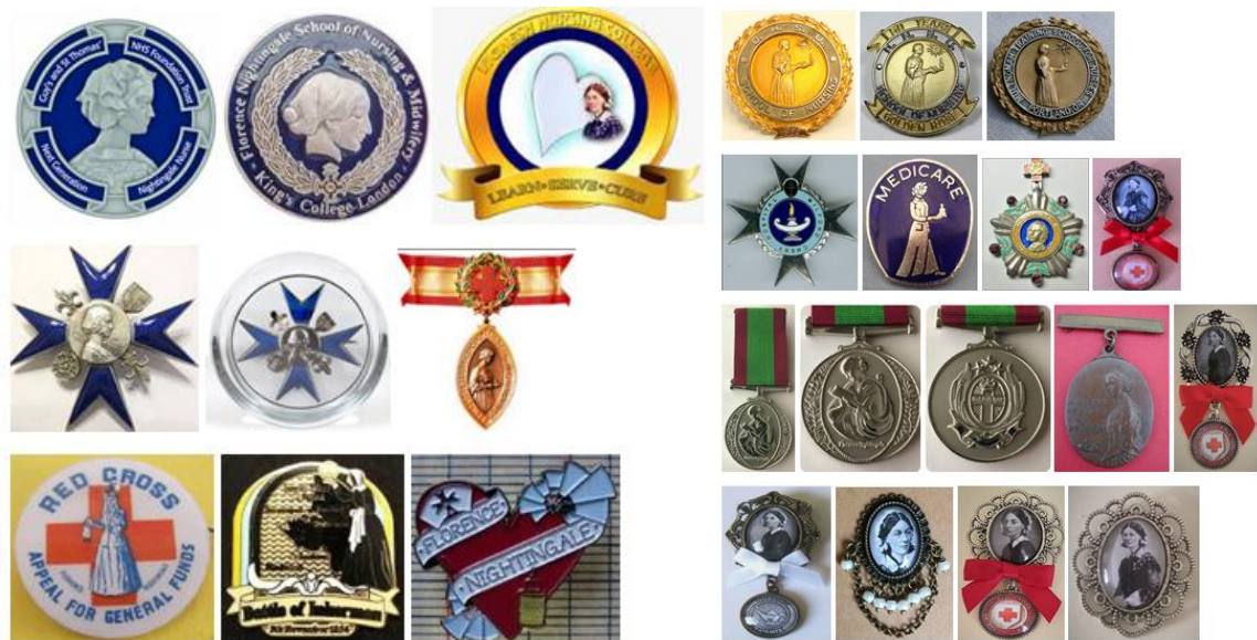
Figure 2: A selection of phaleristic thematic award and memorial signs and brooches dedicated to Florence Nightingale

This concludes another author's research article dedicated to reflecting the memory of Florence Nightingale in the means of phaleristics - on thematic, commemorative badges and brooches. The author is preparing a new, large article about Florence Nightingale, in the mirror of philately, with completely new, previously unused, collection materials.