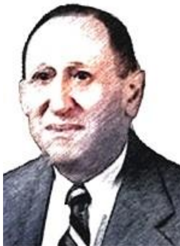
Figure-6D: Leo Kanner, an Austrian American psychiatrist