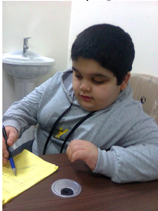
Figure-2B: After treatment, it was possible to convince boy to take a pen to scribble, copy a line or a circle

Obviously, at the age of about ten years, he still had significant mental retardation and was not saying any word, and needed more therapies to improve his cognition and speech.