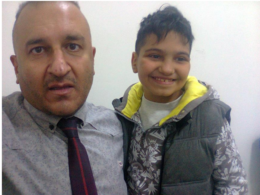
Figure-4B: The boy was happy to take a photo with the doctor

A third boy started treatment at about the age of three years. He was not saying any word and had no eye contact and was not responding to name (Figure-4A). He received intramuscular cerebrolysin 3 ml every third day in the morning (Ten doses monthly) for four months. He also received oral risperidone 1mg daily at night to control hyperactivity. After four months of