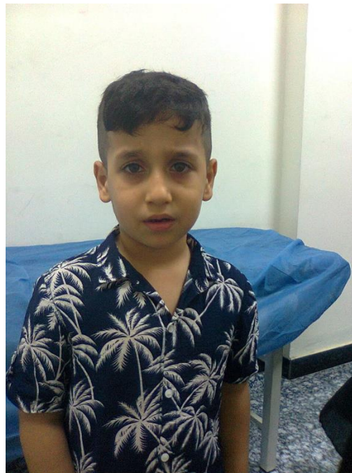
Figure-1: A boy with regressive autism

We have been using a new therapeutic approach aiming at cure of the two major diagnostic features of autism as the standard approach for the treatment of autism disorders in our clinical practice. Courses of intramuscular cerebrolysin were administered based on individualized regimens determined by age and illness severity. The treatment aimed to improve social interactions, such as responsiveness to name and eye contact. Additionally, many patients received neuroleptics to manage hyperactivity and other behavioral abnormalities. Some patients also received citicoline as an adjunctive therapy to improve speech development. It was not possible to record the treatment and follow up of all patients. However, patients included a boy with regressive autism (Figure-1), and a girl with cerebral palsy and autism.