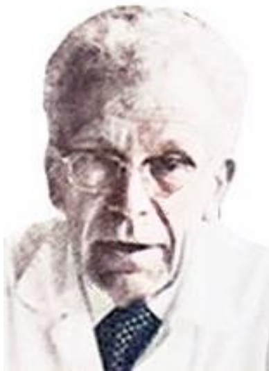
Figure-6B: Hans Asperger, an Austrian physician