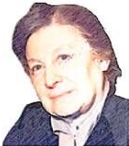
Figure-6A: Grunya Efimovna Sukhareva, a Soviet pediatric psychiatrist

This type was first described by Grunya Efimovna Sukhareva (Figure-6A), a Soviet pediatric psychiatrist in 1925, and she called the disorder autistic psychopathy.