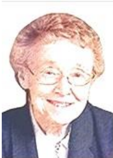
Figure-6C: Lorna Gladys Wing, an English psychiatrist