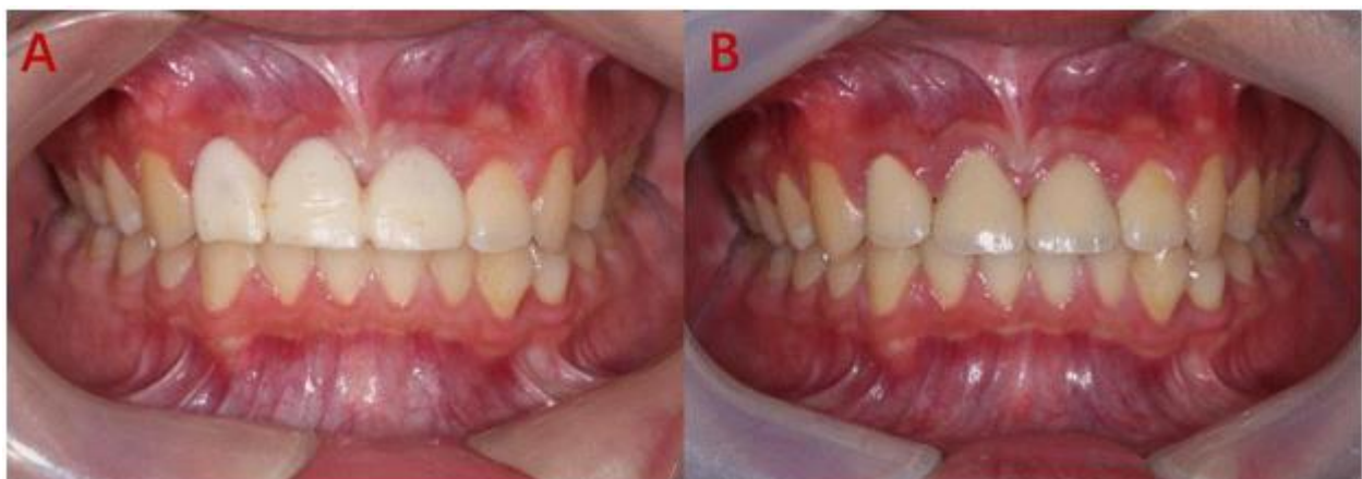
Figure 3 A : The temporary crown was used for 6 months ; B : the ceramic crown was cemented on 12 11 and 21