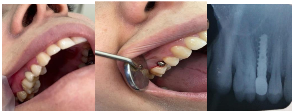
Figure 3: Healing abutment // Final restoration // postoperative x-ray after placement final restoration(6 months later)