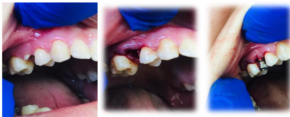
Figure 2: Immediate implant -Badly destroyed upper 5 /fresh extracted socket // implant placement