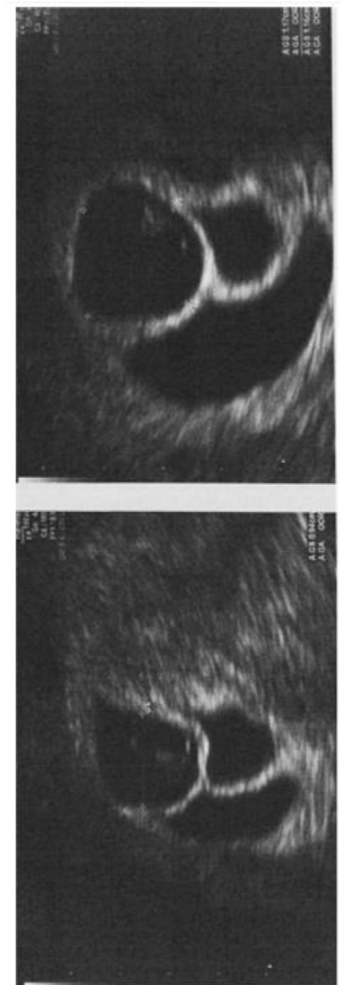
Figure 2: Ultrasound scan showing three gestational sac with lambda sign (trichorionic, triamniotic pregnancy)